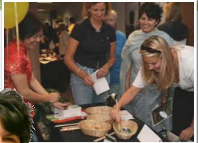
China Garden - chopstick etiquette